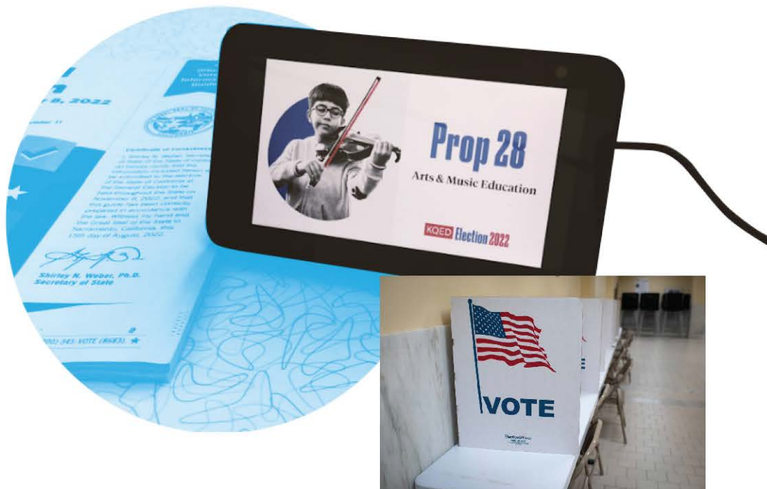
Voting booths during early voting at City Hall in San Francisco on Oct. 11, 2022.