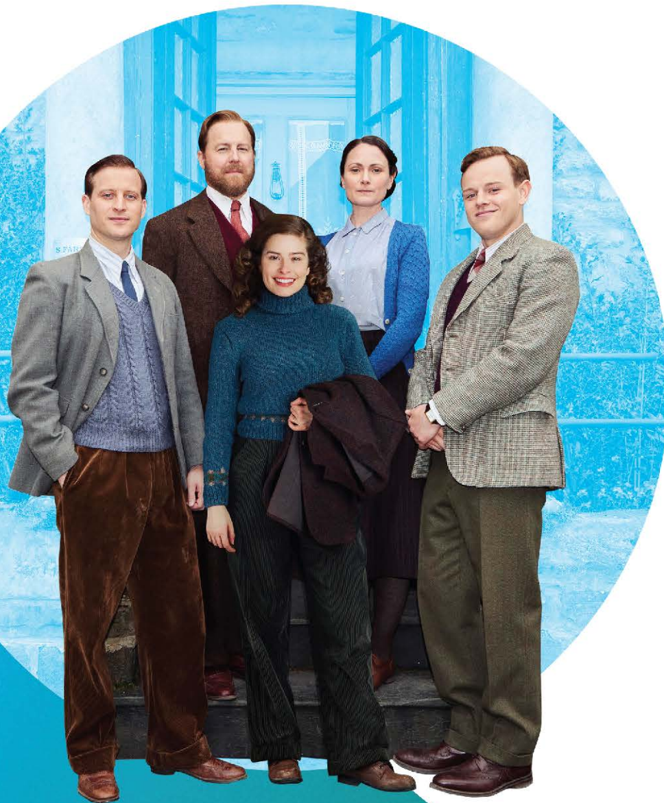
Cast of All Creatures Great and Small.

KQED Director of TV Programming on America's Love Affair With British Telly