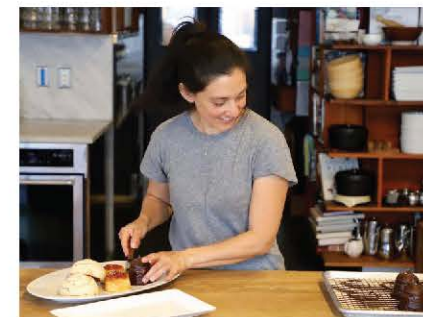
Norte 54's founder plates pan dulce at Nopalito's 18th St. location. (Alan Chazaro)

Order: Garibaldi (pound cake made with seasonal jam), conchas (sweet breads with decadent, non-traditional toppings) and novias (sugar buns)