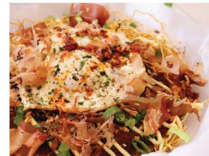
The signature "animal style" okonomiyaki: a veggie pancake with crispy noodles, secret sauce, bacon and more. (Alan Chazaro)

Order: Chopped Cheese (a reimagined New York burger), or the Fish Filet Sando