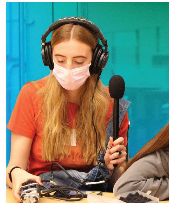
High school students work together during a PRX field recording workshop in April 2022.

Get involved and learn more at kqed.org/podcastgarage .